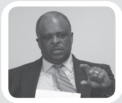
▲休士頓警察局局長。 Harold Hurtt, Chief of HHP

AABC wrote to Mayor White on May 12th, 2006 to recap the security issues discussed in the City Council meeting. Also offered suggestions / requests to increase opening hours of the Ranchester Storefront, help AABC to initiate the installation of surveillance cameras to cover the area streets, increase police presence in Chinatown area, and assist AABC in compiling crime data to better reflect the statistics. Mayor White responded to AABC's request through a hand-written memo to HPD Chief stating 'We need to try to be responsive to this request if at all possible'.